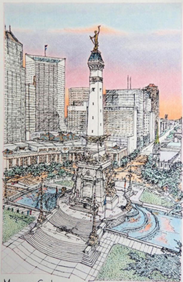
Monument Circle Soldiers and Sailors Monument Indianapolis, Indiana, USA